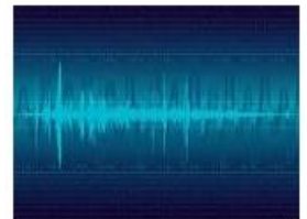
Example of frequencies

The word “ frequency ” has many definitions. The definition that applies to this conversation is: The number of times that a periodic function or vibration repeats itself in a specified time; often one second. The frequency (vibration) is usually measured in hertz, i.e. the number of times that the vibration is repeated within a second.