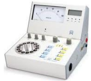
Kindling EAV Device

Though EAV refers to acupuncture, there is no puncture involved. This technology is completely non-invasive. I think that it would make sense to use a new acronym, maybe something like Electro-Energetic Meridian Assessment (EEMA), or at least something that does a better job of describing what this technology actually does. EDS (Electro Dermal Screening) is another name for this technology that doesn't work for me because we are not trying to measure the skin. We are interested in what lies under the skin - the energetic meridians lines.