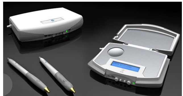
Avatar SC-5 EAV Testing System

One interesting aspect of meridians is that they seem to be able to conduct electrical current almost as if they are a network of copper wires. Electrical conductivity measured at meridian measurement points (MP's) is noticeably higher than electrical conductivity levels measured on skin not associated with an MP. Nobody knows why this is true. This is just a consistently observable fact. And this is the basis of EAV. An EAV device measures electrical conductivity of meridian measurements points (MP's).